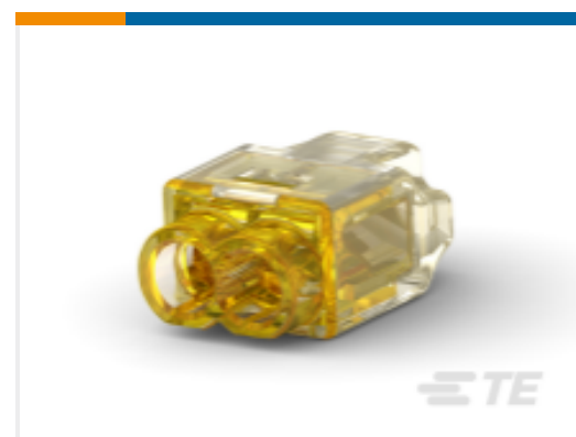
TE Part # 2324697-2 PUSH GRIP CONNECTOR 2P