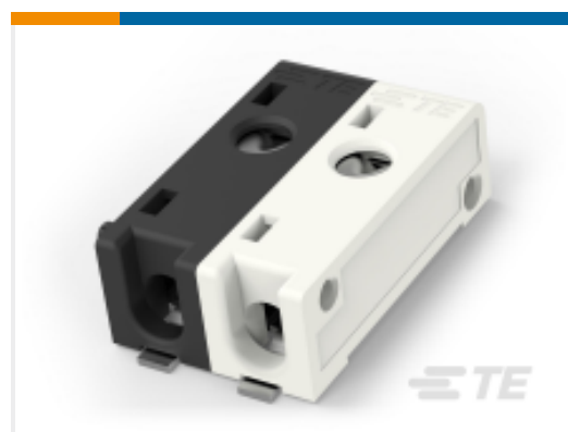
TE Part # 8-2834006-2 2P MRPK CONN_BK/WE